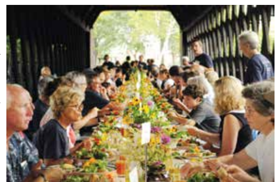
Naked Table lunch highlights the weekend

friends and families, made of Vermont's iconic Sugar Maple which has been responsibly managed and locally harvested. In addition to building and finishing a table, attendees will walk in our forests and celebrate the weekend over a localvore feast on the tables we build . . . stretched end-to-end on a Vermont hillside. In addition, the weekend will offer Saturday night dinner at Hardwick's Claire's Restaurant,