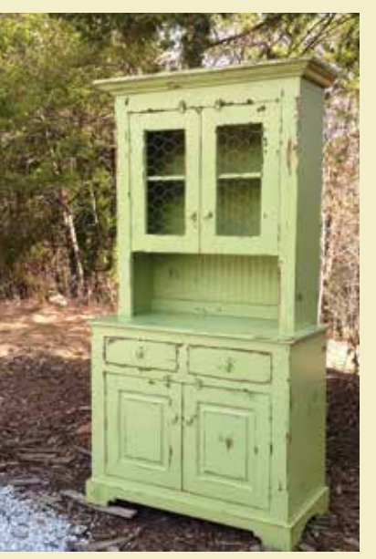
Fable Porch Furniture by March Legend

The furniture is bench made & family crafted on a working farm in the foothills of North Carolina. This is where the crafters' simple but luxurious creations are born, fussed over and constructed. Furniture is their passion. The company makes furniture one piece at a time with the expectation it will last the customer a lifetime. To find out more go to: fableporchfurniture.com